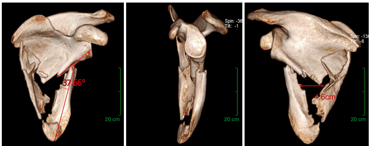
Figure 1 Type B1 fracture. The maximum displacement of the fracture is approximately 4.6 cm, the angle of the fracture is approximately 37.66°.