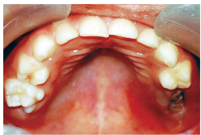
Fig. 7: Healing of socket satisfactory after 7 days

Ten days postextraction the child reported back to the department with complaint of bleeding from socket which started on eating some hard food. On examination of the socket there was dislodgement of fibrous clot and presence of a "liver-clot" (Fig. 8). On discussion with the