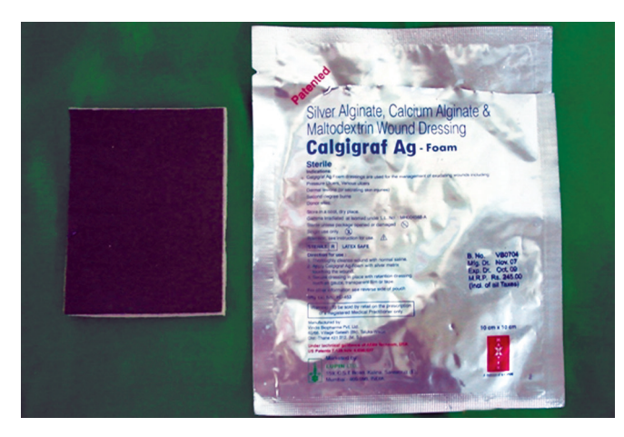
Fig. 9: Calgigraf AG-foam

The appliance was positioned in the child's mouth and areas of excessive pressure on intraoral tissues were identified and reduced (Fig. 11). Instructions were given to parents and child regarding oral hygiene maintenance, placement and daily care of the appliance. A recall visit was scheduled after two days of appliance-delivery for further assessment. Monthly follow-ups were planned to assess healing of extraction socket and eruption of 26.