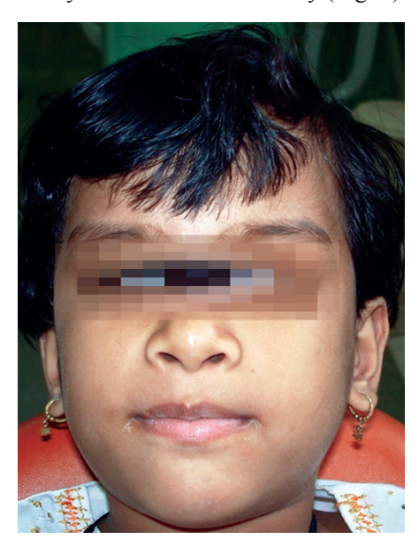
Fig. 1: Girl diagonosed with Glanzmann's thrombasthenia

The patient was recalled to evaluate healing of socket after 1 day and 7 days which was satisfactory (Fig. 7).