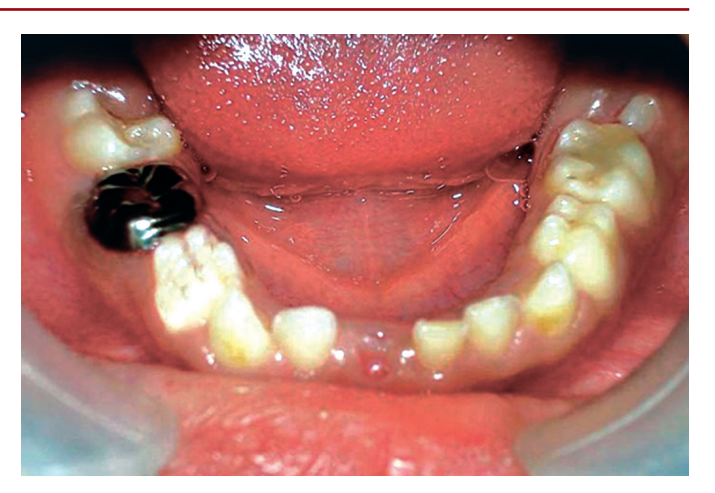
Fig. 6: 85 restored with a stainless steel crown and 75 with composite