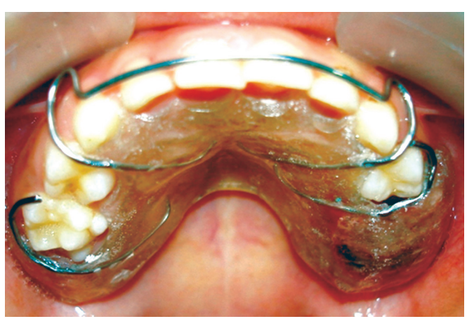
Fig. 11: Appliance positioned in the child's mouth