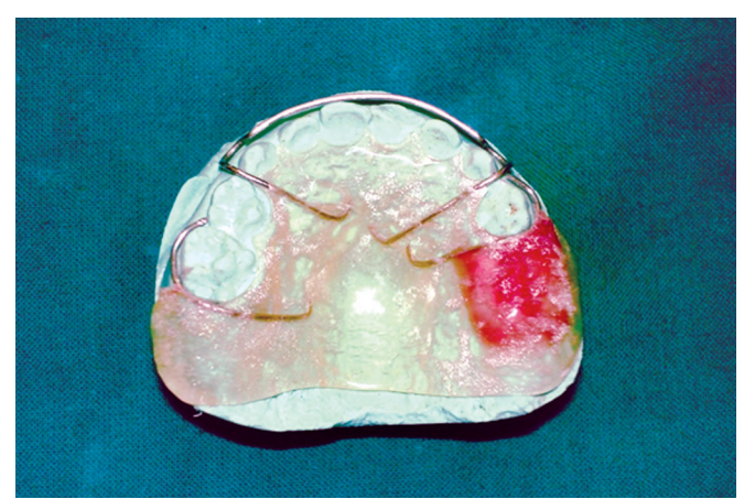
Fig. 10: Fabricated acrylic splint appliance

At 1 month recall healing was slow and inadequate. At the 2-month recall visit healing was satisfactorily complete (Fig. 12). Oral prophylaxis and fluoride application was done. Patient was recommended to continue wearing the appliance until the eruption of 26, which was expected to