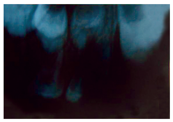
Fig. 4: IOPA of 65 showing radiolucency involving enamel dentin and pulp with severe periradicular bone loss