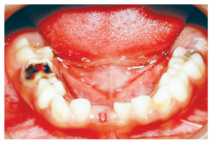
Fig. 3: Mandibular occlusal photograph showing proximal caries on 75 and arrested grossly carious 85