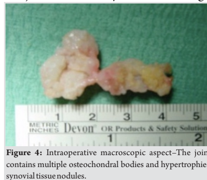
Figure 4: Intraoperative macroscopic aspect—The joint contains multiple osteochondral bodies and hypertrophied synovial tissue nodules.