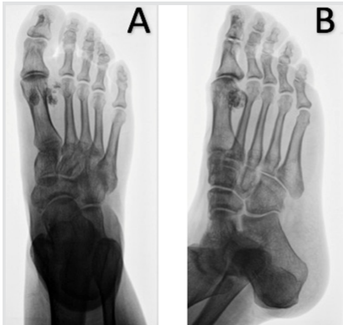
Figure 1: Pre-operative radiologic finding—Anteroposterior (a) and oblique (b) view X-rays of the right foot: Multiple loose bodies around the right first metatarsophalangeal joint at the first web space with preservation of the articular surfaces.

Computed tomography (CT) scan showed a multiple lobulated soft tissue mass with curvilinear calcification around the head of the first metatarsal (Fig. 2).