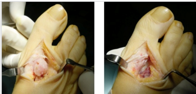
Figure 3: Intraoperative image—Intraoperative aspect of the first web space before (a) and after (b) resection of the tumor.

After 8 years of follow-up, the patient remains satisfied with the result and is symptom free with no clinical or radiographic signs of lesion recurrence. She is able to carry out daily live activities without any difficulty.