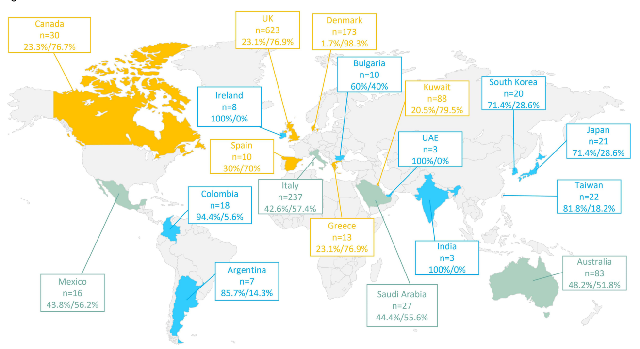
Figure 2 Geographic distribution of adult severe asthma patients with high oral corticosteroid exposure enrolled in ISAR according to biologic initiation status. ISAR: International Severe Asthma Registry. Data are presented as % not initiated/% initiated. Green: approximately equal proportion of biologic non-initiators to initiators; Blue: More likely not to initiate biologics; Yellow: more likely to initiate biologics.