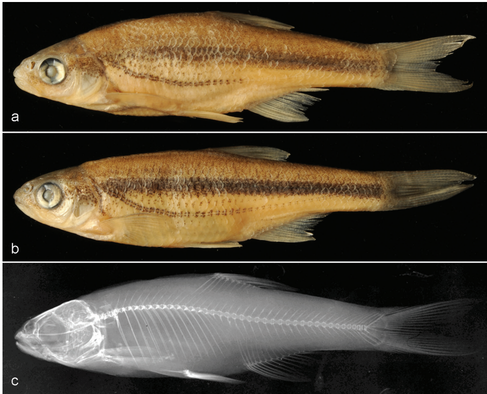
Figure 1. Alburnoides cf. devolli (member of A. prespensis complex of Stierandová et al. (2016), NMW 55706. External appearance of a male SL 50.5 mm and b female 47.9 mm, and c radiograph of same specimen as a .