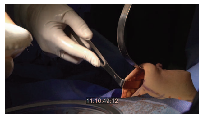
Fig. 2. After the mastectomy, the pocket is sized and the skin flap viability is assessed. At this point, the decision to proceed with reconstruction using this technique or converting to an alternative approach is made.