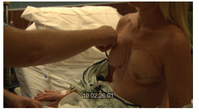
Fig. 1. The breast boundaries are outlined with the patient sitting upright. For this technique, typically an inframammary or lateral breast incision is used.

The approximate implant size is determined preoperatively, sometimes with the aid of 3D imaging. A MemoryShape implant (Mentor, Santa Barbara, Ca.) is wrapped anteriorly and posteriorly with 16 \times 20 -cm-sized ADM [AlloDerm (LifeCell, Branchburg, N.J.) or FlexHD (MTF, Edison, N.J.)] (Fig. 3). In some cases, 2 pieces are used, forming a complete 360-degree implant wrap. The margins of the resultant unit are used to suture the implant to the chest wall and inframammary fold, avoiding migration or rotation of the implant. Alternatively, an anterior wrap using a single ADM piece can be used. This anterior wrap is secured with posterior spanning 2-0 PDS sutures, allowing the posterior texturing of the implant to assist in implant location and adhesiveness to avoid malposition. The implant/ADM is positioned in the pocket above the pectoralis and secured to the chest wall at 2 or more locations inferiorly. The posterior aspect of the nipple is positioned and sutured to the anterior portion of the ADM with 2-0 PDS suture to stabilize nipple location and avoid slippage. A 15Fr drain is placed in the mastectomy pocket, positioned around the periphery of the implant and fastened at the skin level with 3-0 silk (Ethicon, Somerville, N.J.). The incision is closed with 3-0 monocryl (Ethicon, Somerville, N.J.) in the subcutaneous and subcuticular levels and the wound is sealed with tissue adhesive. The inframammary fold and lateral pocket are reinforced with