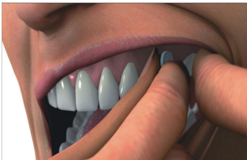
Figure 1 The principle of placing a fentanyl effervescent buccal tablet in the cheek pouch.

FBT displays a further increase in onset of action over the OTFC solid drug–matrix formulation. In order to achieve these advantages practical considerations that affect the microenvironment adjacent to the dissolving of FBT need to be borne in mind. Patients are instructed to place the buccal tablet above a molar tooth between the upper cheek and allow it to dissolve for approximately 14 to 25 minutes (Figure 1). FBT has a mildly bitter taste, and if the tip of the tongue is placed on a dissolving tablet, a slow “fizzing” sensation similar to that produced by a carbonated beverage