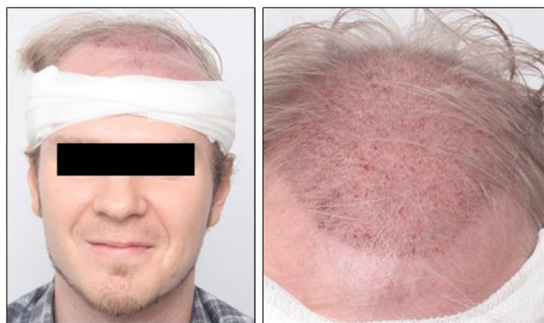
Figure 1 Representative photographs of the operating field of a male patient (28 years) directly after hair transplant surgery at the Moser Medical, Clinics for Aesthetic and Plastic Surgery in Vienna.

Approximately 2 days after hair transplant, volunteers started to use the test shampoo and continued until their stitches were removed (between 7 and 23 days). They were instructed to utilize a realistic amount of shampoo and to wash their scalp at least once a day with it. During the study, subjects were required to refrain from using other shampoos as well as other scalp treatments. The test area was the scalp, in particular, the area where hair follicles were transplanted.