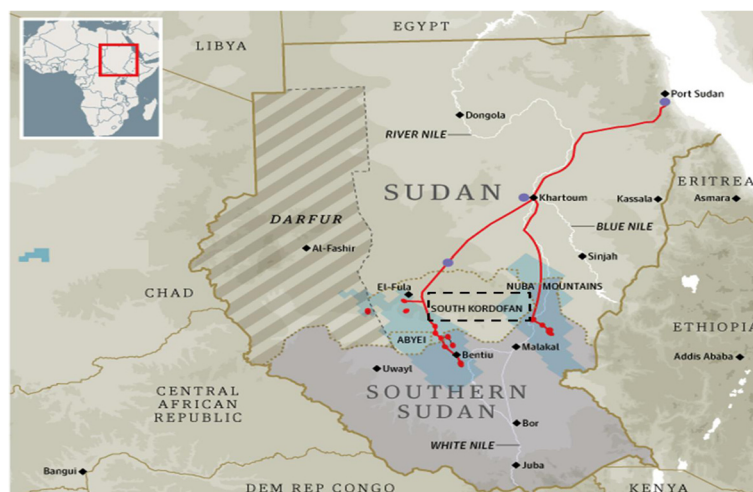
Figure 2 Location of the study area.

Other factors that were associated with infection were swimming and bathing in open water sources (OR 1.48; 95% CI 1.15–1.89), contact with open water sources for more than once a week (OR 3.92; CI 3.06–5.02)