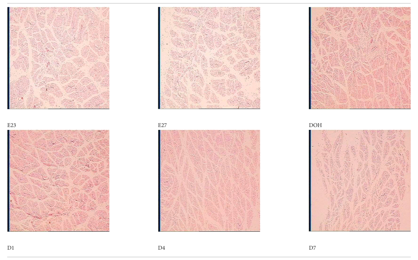
<sup>a</sup>Age refers to embryonic day 23 (E23), day 27 (E27), day of hatch (DOH; after hatch but before feeding), and day 1 (D1), 4 (D4), and 7 (D7) post hatching. <sup>b</sup>One of five images from each sample (in total 18 embryos were used to measure myofiber parameters in each sampling timepoint).

Kornasio et al., 2011). The breast muscle is not only an important economic parameter but also plays an important role in metabolism, which is mainly due to its relatively large size and glycogen storage capacity (De Oliveira et al., 2008; Saki et al., 2014). Although the contents of glycogen per unit mass of breast muscle are less than those in the liver, it accounts for the largest amount of total glycogen stored in the body (Uni et al., 2005). As reported, Chen et al. (2009) noted that pectoralis mass decreased with the age of duck embryos during the period of late-