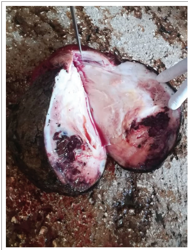
FIGURE 2: Cut section of the resected mass showing colour heterogeneity ranging from diffusely white to multifocally brownish areas and tinged with blood from haemorrhage in its central region.

The mass weighed 8 kg and was predominantly gelatinous and glistening when observed on the cut section, exhibiting colour heterogeneity ranging from diffusely white to multifocally brown and appearing tinged with blood from haemorrhage in its central region (Figure 2).