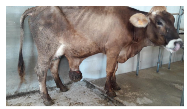
FIGURE 1: Cow at 6 days postpartum with poor body condition, showing a large skin mass located on the ventral abdomen in the umbilical region. The small udder is also visible.

Preparation for surgical excision included sedation with intravenous xylazine hydrochloride (Nerfasin, Ati, Italy, 20 mg/mL) at a dose of 4 mg/100 kg (0.2 mL/100 kg), followed by epidural administration of 7 mL of procaine hydrochloride and adrenaline tartrate (Aticaina, Ati, Italy, procaine hydrochloride 40.0 mg/mL, adrenaline tartrate