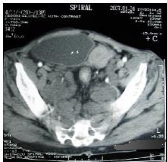
Figure 6. Neurofibromas and ovarian cyst