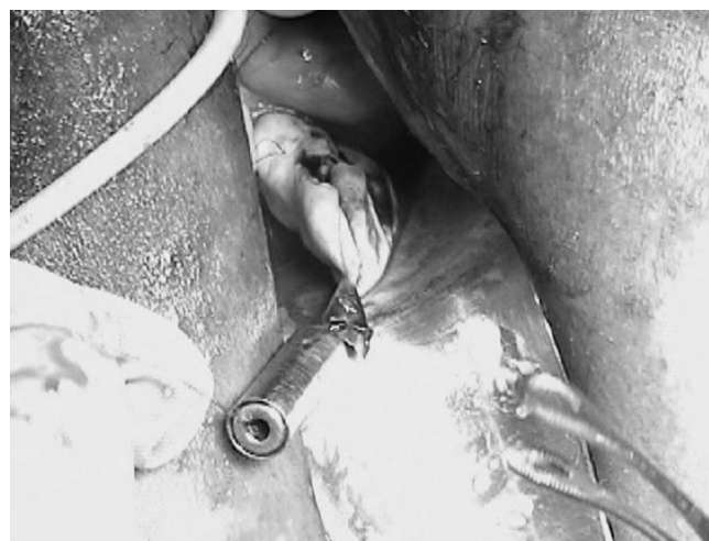
Figure 4. Transvaginal magnet and cyst wall extraction.