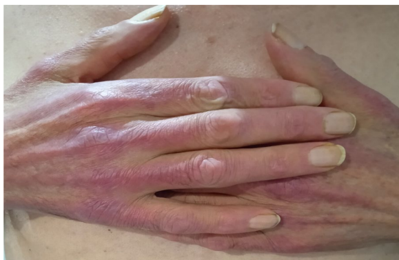
Fig. 1 Erythematous rash on the hands

Owing to clinical signs suggestive of dermatomyositis, a requested biological assessment showed increased lactate dehydrogenase (LDH) 301 IU/L, with normal creatine phosphokinase (CPK) 148 IU/L and antinuclear antibodies positive to 1/640 of homogeneous types. The final diagnosis of paraneoplastic dermatomyositis with an overall assessment of disease activity by the physician (IMACS) assessed on a four-point Likert scale corresponding to a very severe active disease associated with