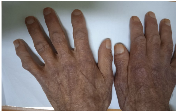
Fig. 4 Disappearance of skin lesions

It is more common in Asia and North Africa, where it affects 5–9 people per 100,000 [5]. The undifferentiated pathological subtype is the most common, most often associated with paraneoplastic syndromes such as fever, leukemoid reactions, and osteoarthropathy [6]. The combination of dermatomyositis and cancer is common, affecting 18–32% of patients [2]. However, its association with pharyngeal carcinoma is not well described. Most often it is associated with the undifferentiated type, somewhat less frequently associated with the differentiated type, and never with well-differentiated cancer [7]. It may be more severe than the consequences of the primary tumor itself and may precede, follow, or be concomitant with the diagnosis of cancer. This is the finding in our case where symptomatology was dominated by dermatomyositis.