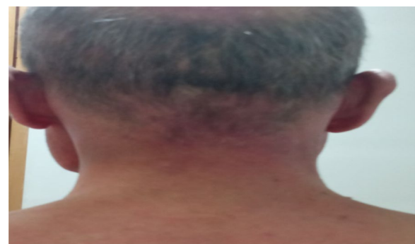
Fig. 3 Erythematous rash on posterior side of neck

Nasopharyngeal carcinomas (NPCs) account for less than 1% of all malignant tumors and affect about 1 person in 100,000 in North America and Western Europe.