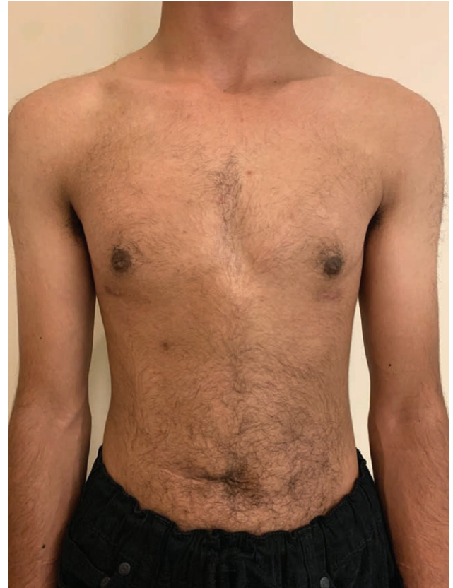
Fig. 3. 1 month post-operative follow-up: frontal view.

plane from both breasts. Liposuction was also used to contour and break up adipose tissue. Surgical subcision of excess breast tissue adherent to the subdermal plane was performed using a V-dissector cannula and no. 12 blade scalpel. The pull-through technique of remaining glandular tissue was then performed using a 19-cm straight Brand tendon tunnel forceps. Dissection was carefully performed by pinching the overlying skin with 1 hand while the other used a "grasp-and-pull" motion (Fig. 2). This was performed throughout until the contour of the chest felt smooth. The glandular tissue excised from each breast weighed 39g and 38g.