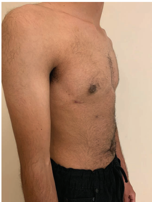
Fig. 4. 1 month post-operative follow-up: lateral view.

breast volume, degree of excess skin, and NAC size and position. 5 This algorithm has been utilized over the years with successful outcomes. Since then, multiple alternative algorithms have been proposed with similar congruency amongst them. 8