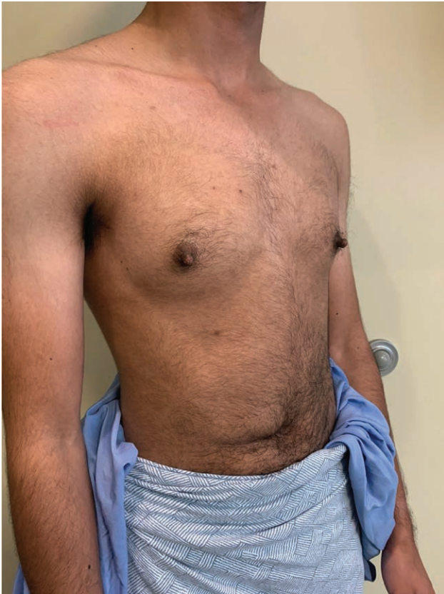
Fig. 1. Pre-operative examination of the chest.

The patient was placed in a supine position and general anesthesia was administered. Tranexamic acid was administered prophylactically. An estimated 250cm 3 of Klein solution (1L of normal saline, 1000mg lidocaine, 1mg epinephrine, and 10 mEq of bicarbonate) was infiltrated into each breast. A 10-mm incision inferolaterally in the inframammary fold was used to access the glandular tissue. Power-assisted liposuction with a 4-mm cannula was used to remove 160cm 3 of aspirate percutaneously in a subcutaneous