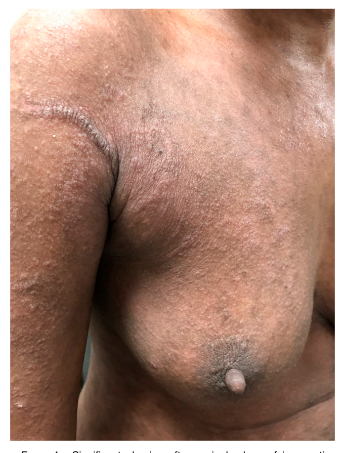
FIGURE 4. Significant clearing after a single dose of ivermectin. However, a prominent burrow is now visible over the right axillary region, a scraping of which revealed scabies mites, suggesting the need for prolonged treatment. This figure appears in color at www.ajtmh.org.

This is an open-access article distributed under the terms of the Creative Commons Attribution (CC-BY) License, which permits