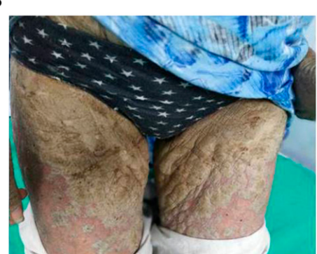
FIGURE 1. (A, B) Extensive crusted scabies with thick, grayish yellow crusting, especially around the limb girdles. Linear fissures are also visible in the axillary regions (A). No defined psoriatic plaques could be made out at this time. This figure appears in color at www.ajtmh.org.