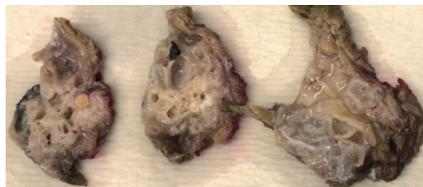
FIGURE 2: Serial sections of the multilocular cystic lesion in the head of the pancreas showed variable-sized cysts filled with clear fluid, and the cystic wall was smooth without any solid or papillary areas.

On gross examination, a multilocular cystic lesion was identified in the head of the pancreas with cysts ranging from 0.5 to 3 cm in size (Figure 2). The cysts were filled with clear fluid, and the cystic wall was smooth without any solid or papillary areas. Microscopically, the lesion consisted of multiple variable-sized cysts separated by fibrous stroma and residual islands of unremarkable pancreatic tissue (Figure 3(a)). The cysts contained eosinophilic secretions and were lined by a single layer of bland epithelium ranging from nondescript flat/cuboidal epithelium to apparent acinar cells (Figure 3(b)). Cytologic atypia and mitotic figures were absent. Occasional calcifications with fibrosis, histiocytes, and cholesterol clefts were noted. The immunohistochemical analysis was performed and demonstrated that the cyst lining cells were positive for trypsin (Figure 3(e)), CK7 (Figure 3(f)), and CK19 but negative for synaptophysin and chromogranin. Proliferative index marker (Ki-67) is less than 1%. Based on these histomorphological and immunohistochemical findings, the final diagnosis was confirmed to be ACT. The prior intraoperative biopsy was retrospectively reviewed to reveal similar epithelial lining to that seen in the resection specimen (Figures 3(c) and 3(d)). One and a half years have passed after surgical resection and no recurrences of the lesion and symptoms were documented.