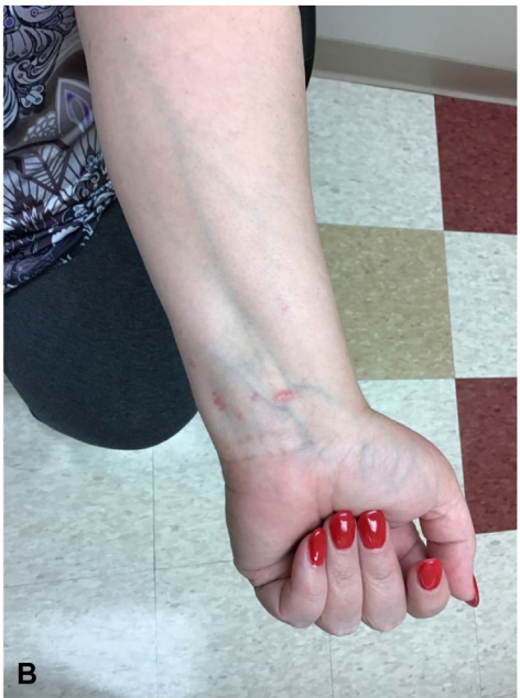
Fig 1. Lichen planus eruption 4 months after allergic contact dermatitis and 2 months after discontinuing guselkumab. Clinical examination shows scaly papules and plaques across the lateral aspect of the right upper arm (A) and the palmar aspect of the left wrist (B).