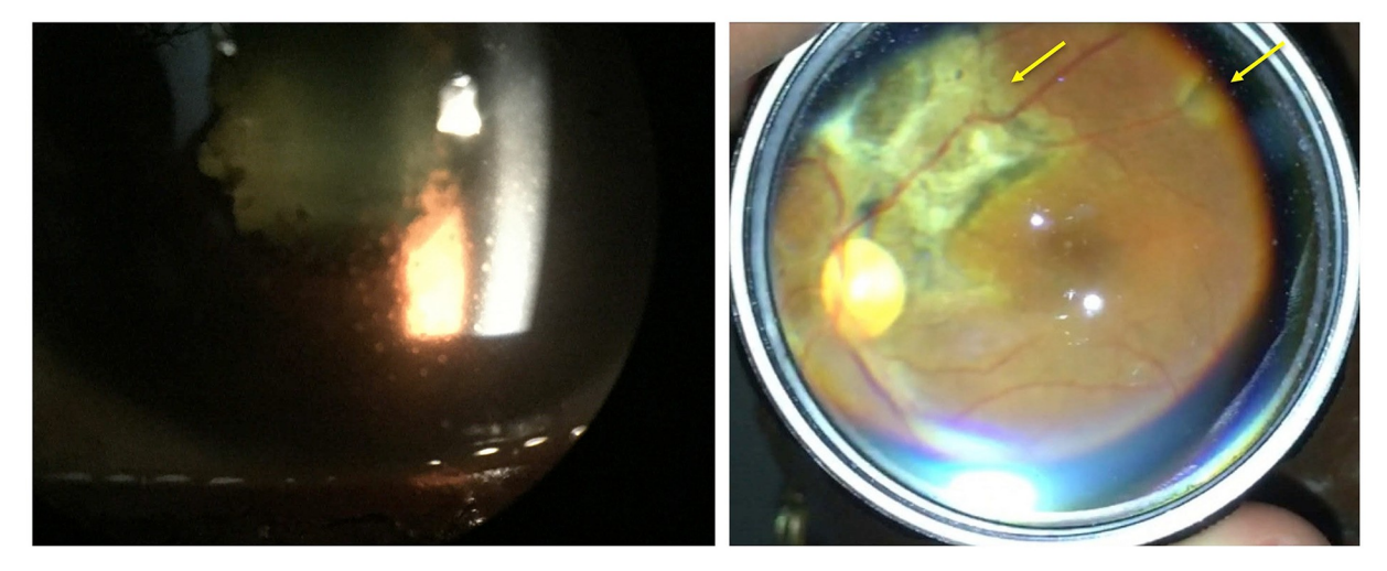
Fig 2. Slit lamp photograph of an EVD survivor with panuveitis shows keratic precipitates on the cornea with posterior synechiae (left). Treatment with oral prednisone, topical difluprednate and atropine were required. Another EVD survivor shows multifocal chorioretinal scarring (yellow arrows) indicative of posterior uveitis. All photographs are taken with an iPhone either at the slit lamp (left) or with a condensing lens (right).

https://doi.org/10.1371/journal.pntd.0007209.g002