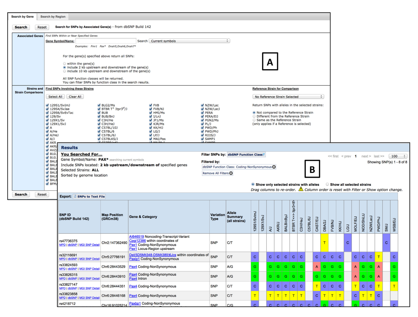
Figure 2. Screenshots of improved SNP data interfaces in MGD. (A) Gene and region search forms are on different tabs to simplify the search interface. Mouse strains for which data are available are shown in alphabetical order and are selected with checkboxes. (B) Search results can be filtered by SNP functional classes. Columns can be manually re-ordered using 'drag and drop'.

nal editors and other data resources to ensure use of nomenclature standards. In addition, MGD, RGD and the HUGO Human Gene Nomenclature Committee (20) collaborate to co-assign genome feature symbols that are consistent for orthologs across species. To contact the MGD nomenclature coordinator for assistance with nomenclature, use email: nomen@jax.org.