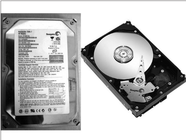
Figure 1: Main secondary storage device of a PC is a hard drive. This is a small case that contains magnetic-coated platters that rotate at high speed

c) number of sectors on each track, and d) the amount of data that can be stored in each sector. [2,3]