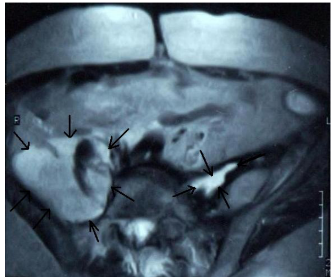
Figure 1 Abdominal MRI showing bilateral psoas muscle abscesses (arrows).

The case was considered as a primary psoas abscess and was hospitalized in the general surgery service. Comprehensive biochemical tests (including tumor markers, collagen tissue diseases, tuberculosis etc.) were carried out on the patient. Blood cultures (for fungi, aerobic, anaerobic bacteria and mycobacteria) and urine cultures were taken. In the meanwhile, although endoscopic and colonoscopic examinations were carried out (in order to detect unspotted diseases such as tumoral formations, Crohn's etc.), no results were obtained. It was decided to perform a surgical open drainage on the abscess upon detecting that there were no laboratory findings to prove the presence of a