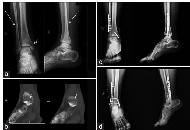
Figure 1: Inclusion criteria of the patients in the study. (a) Postoperative X-ray showed an SMM (arrowhead) and an oblique fibular fracture (arrows) that was higher than 5 cm above the tibial plafond. (b) Postoperative computed tomography showed a SMM fracture (arrowheads). Postoperative X-ray without (c) and with (d) syndesmotom screw fixation. SMM: Supracollicular medial malleolar.

To be included in our analysis, 71 patients met the selection criterion. Sixty-one patients among them completed the 3-year follow-up. The surgery records of each patient, especially the timing and order of stress test, were reviewed carefully, so as to validate their intraoperative stress test strategies, before or after bony fixation. These patients were recorded with a positive prebony-fixation stress test and a negative postbony-fixation stress test. The 61 patients were divided into two groups, namely with or without syndesmotom screw fixation [Figure 1]. Twenty-nine patients were treated without a supplemental syndesmotom screw fixation, according to the negative intraoperative stress test after bony fixation, while 32 patients were treated with an additional syndesmotom screw fixation based on the positive intraoperative stress test before bony fixation [Figure 2].