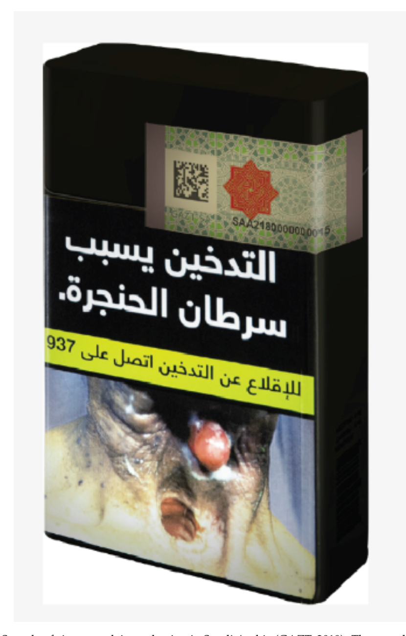
Figure 1. Sample of cigarette plain packaging in Saudi Arabia (GAZT, 2019). The sample description from the top: Tax Stamp, Health Warning Label, Quitline Phone Number, Large Pictorial Warning.

With more voices claiming the cigarettes were adulterated, the GAZT responded on 20 November, 2019 through its Twitter account. It provided images explaining the presence of taxation stamps on cigarette packs as proof of legality [39]. Hashtag users called on each other to file complaints with the Ministry of Commerce and Investment (MCI) for commercial fraud because the expiry dates were not included on the packets. On its Twitter account, the MCI stated that the issue was not under its jurisdiction, and deleted the tweet a few days later. Following this, the Ministry of Health Tobacco Control Program (MoH-TCP) received hundreds of emails and calls over a period of three days on the issue of the new cigarettes. There was also a significant increase in Google searches on the topic (Figure 2).