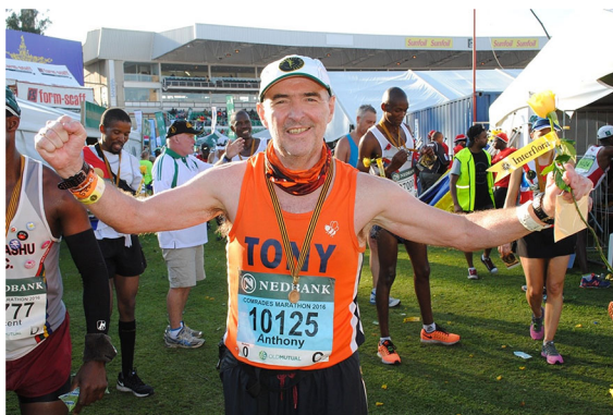
Fig. 1 The joy of having completed a 56-mile ultramarathon, 12 months pre-diagnosis

telling my adult children. Thankfully they live within 30 min of us, but I had to ask them to come round one evening because I had some news that I needed to tell them. Goodness knows what they imagined was going on, but I can pretty much guarantee that it was far worse than their worst fears.