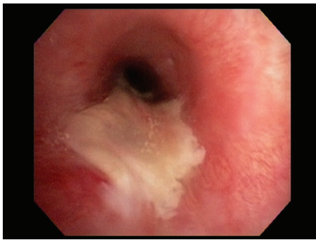
FIGURE 2: Endobronchial view of left main bronchus repair.

superior pulmonary vein was mobilized. Branches going to the right upper lobe were identified and divided with silk stick ties and free ties. The fissures between the middle lobe and upper lobe were completed with multiple firings of a GIA stapler. All interlobar lymph nodes were resected. The right upper lobe bronchus was sharply dissected free. The right lung was reinflated and the bronchial stump was competent to 40 cm pressure; however, with positive pressure ventilation and the right hemithorax filled with saline, a small air leak was identified. Further evaluation revealed the air leak to be arising from a long linear tear located along the left mainstem bronchus and extending from the carina as far down the left mainstem bronchus as could be visualized. The double-lumen endotracheal tube was identified in the region of injury. This left main bronchus injury was not evident during the course of the case because the bronchial balloon had successfully isolated the left lung. The injury and resultant air leak only became apparent with deflation of the bronchial balloon and the resumption of right lung ventilation.