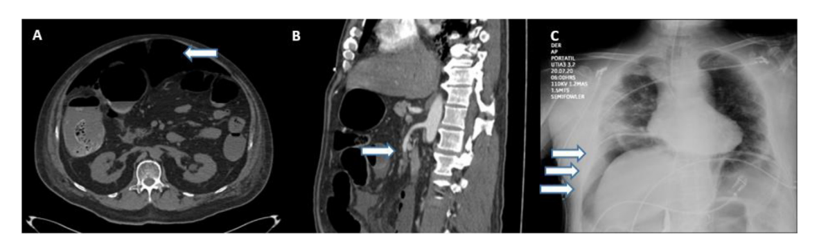
Figure 1 (A) CT scan showing pneumoperitoneum (arrow). (B) CT scan showing superior mesenteric artery thrombosis (arrow). (C) Chest X-ray showing subdiaphragmatic air (arrows).

The mean time interval from admission to abdominal symptom onset was 10.6 days (range 7–16). Overall inpatient mortality due to SARS-CoV-2 infection at our hospital is 10.05%. In our study group, five patients survived, resulting in a 50% mortality rate and a relative risk of death of 4.97, compared with the rest of our hospital's SARS-CoV-2 population. The full details of each of our study patients are included in Table 3.