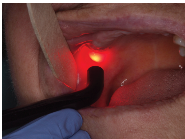
Fig. 2: Application of handpiece for photobiomodulation at the affected area of LRONJ.

After informed consent we performed a PBM treatment of the affected area using a 635 nm wavelength diode laser (Lasotronix®, Diode Laser DiodeLX model SMART M, Żytnia, Piaseczno, Poland). We performed 5 sessions during 5 consecutive weeks (one session per week) using an 8-mm cylindrical applicator handpiece, in a continuous mode for 25 seconds, delivering 10 J/cm 2 in affected area (Fig. 2). All safety measures for