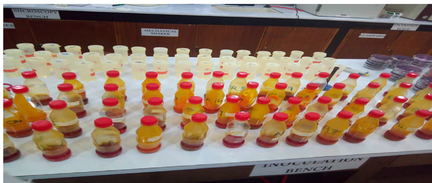
Figure 2. Oil sample and diluents for serial dilution and plating.