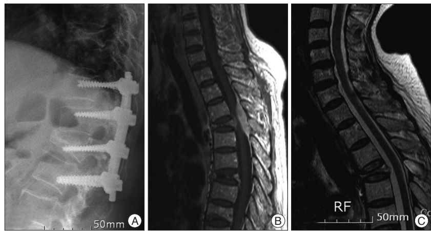
Fig. 3. Case 3. A : Before the diagnosis of multiple myeloma, the patient underwent posterior spine fusion for a multilevel compression fracture. B : Sagittal T-1 enhanced image shows the posterior epidural mass extending from T3 to T5 with a compression fracture at the T4 and T7 vertebra. C : A follow-up MRI obtained 1 month after radiotherapy shows a complete epidural mass response without progression of pathological compression fractures.