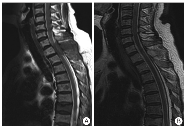
Fig. 1. Case 1. A : Sagittal T2-weighted magnetic resonance image (MRI) of the spine showing posterior epidural mass extending from the C7 to T1 vertebra. Multiple marrow signal changes are noted at the vertebral body. B : Follow-up MRI obtained 1 month after radiotherapy shows a complete epidural tumor response.

cord on T1-weighted images and hyperintense on T2-weighted images, with moderate contrast enhancement. No pathological fracture of the adjacent vertebra was found. High-dose steroid therapy (dexamethasone, 40 mg/day) and emergent radiotherapy were performed under the diagnosis of MM and spinal cord compression. Before this medical treatment, her neurological status was Frankel B. MRI, checked after 3000 cGy fractioned radiotherapy for the C7-T2 lesion, revealed complete resolution of the epidural mass (Fig. 1). However, during 6 months of follow-up, the patient did not experience any neurological improvement (final neurological status, Frankel B).