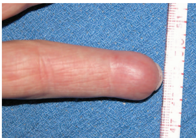
Fig. 4. Appearance of the digit 3 months after fat grafting procedure; the patient had 6-mm 2-point discrimination measured in the digit at this time.

liposuction with handheld cannulas. Fat was prepared according to the Coleman method. 6 Processed fat was injected via multiple percutaneous stab incisions into the volar pulp of the left long finger; in total 1.5 ml of fat was injected. Our patient tolerated the procedure well and now has increased bulk of the tip, reduced hypersensitivity, and 6-mm 2-point discrimination measured in the digit at his last follow-up visit, 3 months after his fat grafting procedure (Fig. 4). There has been no appreciable resorption of fat in the fingertip and no deformity at his abdominal donor site. At this point the patient has been undergoing treatment with an ultrasonic bone stimulator for a non-union of his index finger distal phalanx and bone grafting was being considered should this modality fail.