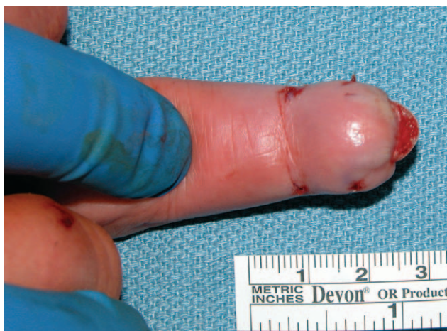
Fig. 3. Intraoperative appearance of the digit at the time of fat grafting. Fat grafts were deposited via 4 stab incisions into the volar pulp.