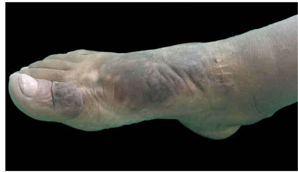
Figure 5 Clinical appearance of the right foot and ankle after 11 months of treatment with intralesional corticosteroid therapy. An important reduction of nodules and cutaneous texture is observed.

Graves' disease is triggered by the emergence of antibodies against TSH receptors. Exophthalmia, acropathia, and