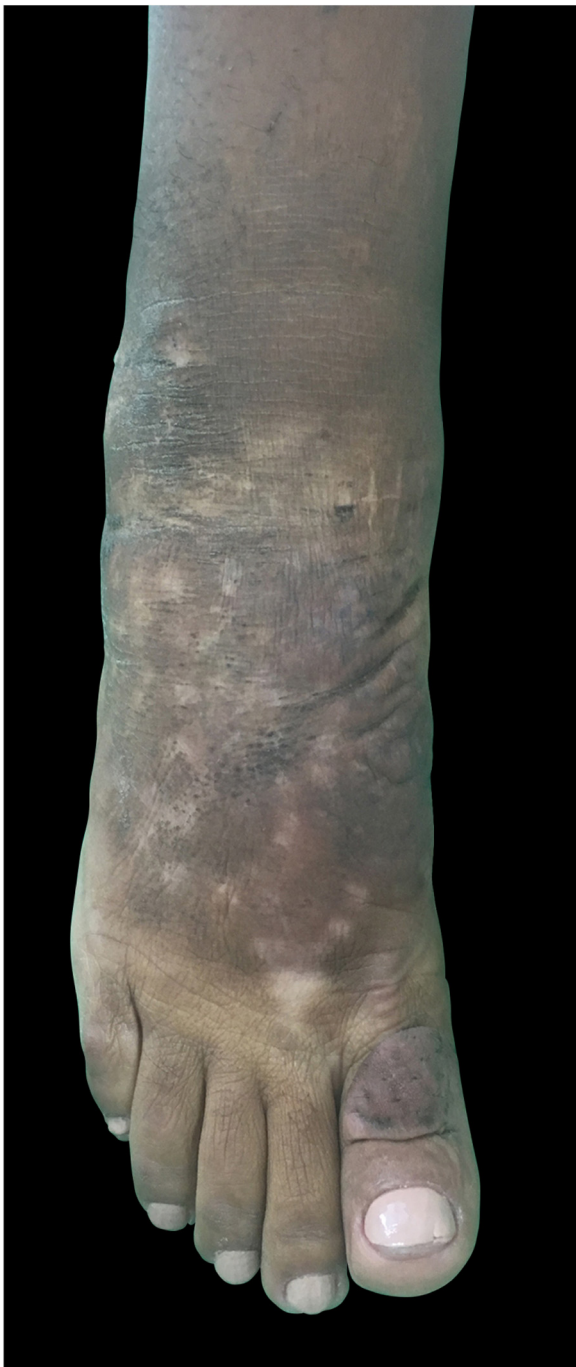
Figure 4 Clinical appearance of the right foot and ankle after 11 months of intralesional corticosteroid therapy. Almost total reduction of nodules and edema, making the appearance resemble the contralateral foot.

A clear decrease of non-depressible edema and nodules was observed, improving the coloration of the affected skin, allowing the patient to wear shoes that she was previously unable to due to her condition (Figs. 4 and 5).