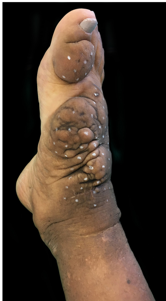
Figure 2 Clinical appearance of the right foot and ankle at the first session of intralesional application of corticosteroid. Non-depressible edema associated with hyperpigmentation reaching the lower third of the right limb, including lateral and posterior portions.

In light of confirmation of the clinical condition and the patient's desire to improve her appearance, a therapeutic program was established with the use of triamcinolone acetate 20 mg/mL without dilution, applied over 50 points, 0.1 mL per point deposited through a 26G 1/2 needle into the reticular dermis, with the distance between two application points standardized at 1.0 cm. The following areas were treated: dorsum and lateral region of the right foot, proximal phalanx of the right first toe, and the left ankle. The initial frequency of the procedure was monthly. After four months and based on a very satisfactory clinical response, the interval between applications was increased to bimonthly, with a reduction of the compound that was administered by 50%, maintaining a satisfactory clinical response.