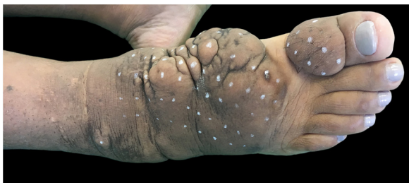
Figure 1 Clinical aspect of the right foot and ankle: confluent brownish nodules on waxy plaque. Hypertrichosis and hyperpigmentation are noted. First session of intralesional application of corticosteroid.

intravenous immunoglobulin, generating a mild to moderate response, with unpleasant results in severe cases. 1,4 The current article describes the authors' experience with intralesional corticotherapy in patient who present with the elephantiasic form, noting a satisfactory and encouraging clinical response during the follow-up of over 11 months.