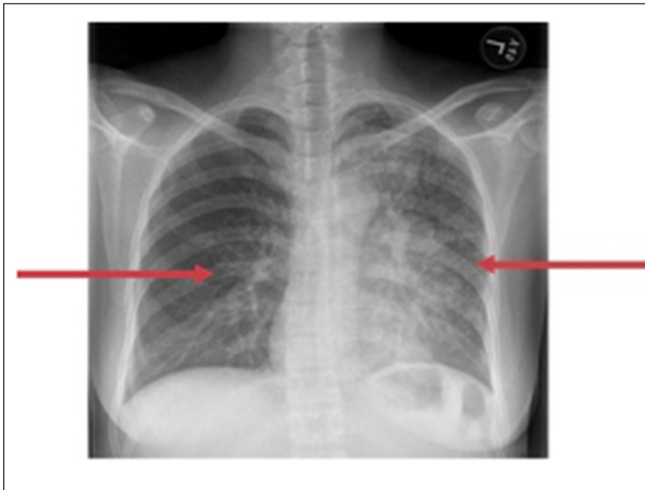
Figure 1. Chest X-ray of a 37-year-old woman. The chest X-ray (CXR) shows reticular nodular infiltrates throughout the lung.