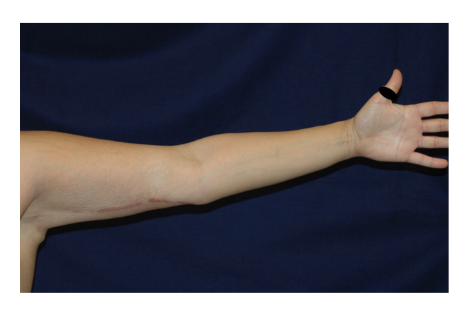
Fig. 6 Post-operative result 90 days after surgery in a patient of the piNPWT group who developed an hyperchromic scar

limits the number of complications without eliciting treatment-related cutaneous damage or causing patient discomfort responsible of premature dressing change. However, no beneficial effect was observed in preventing major complication Clavien-Dindo grade III [26]