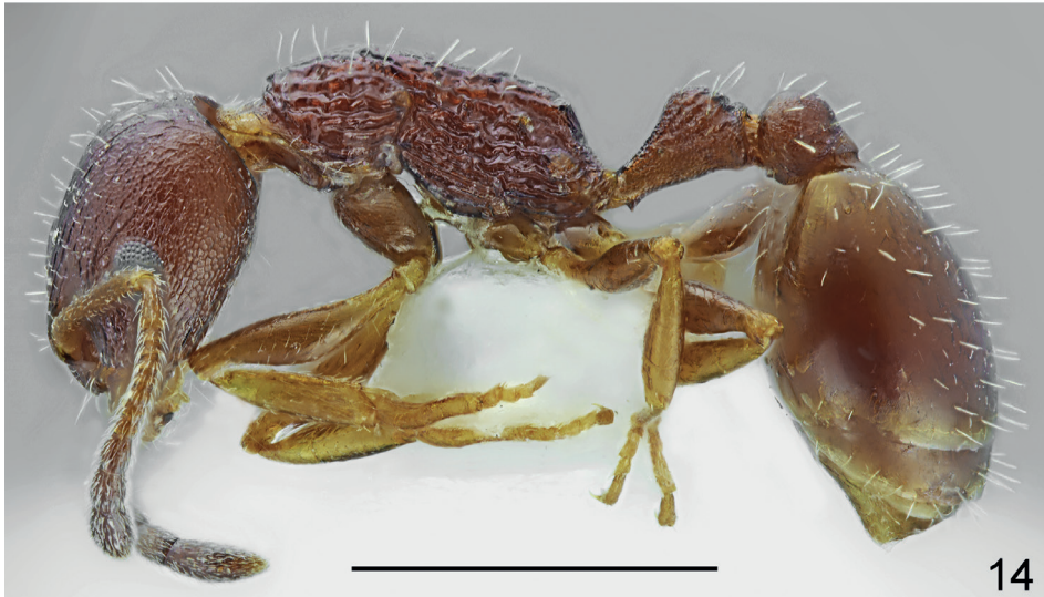
Figures 13, 14. Paratype worker of Temnothorax anodontoides Dlussky & Zabelin, 1985. 13 dorsal 14 lateral. Scale bar: 1 mm.