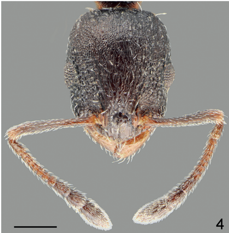
Figures 3, 4. Head and antennae of holotype workers 3 Temnothorax arkasi sp. nov. 4 Temnothorax euboae sp. nov. Scale bars: 0.25 mm.