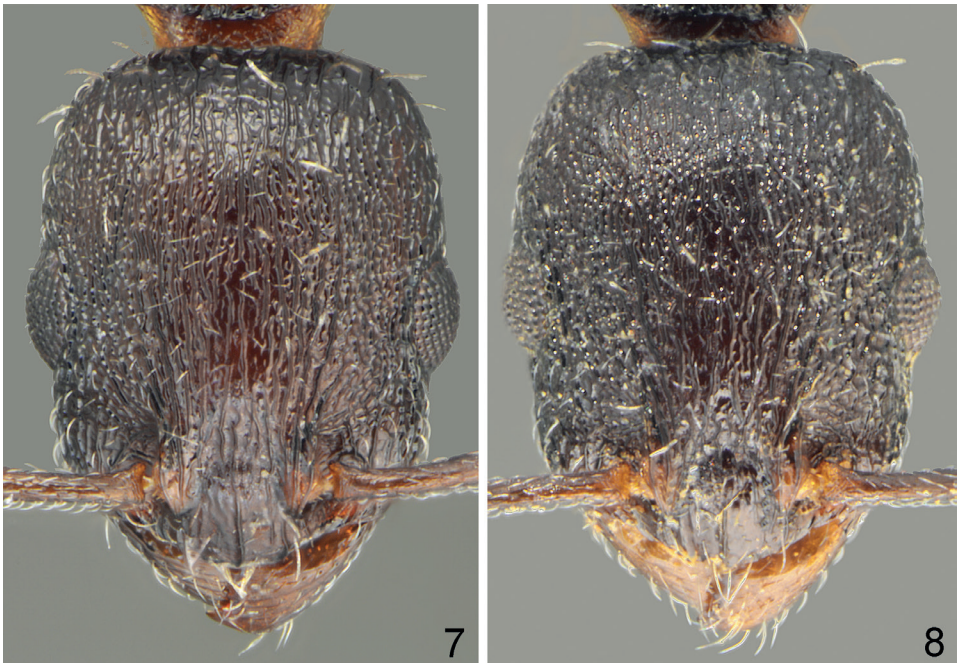
Figures 7, 8. Head sculpture of holotype workers 7 Temnothorax arkasi sp. nov. 8 Temnothorax euboeae sp. nov.