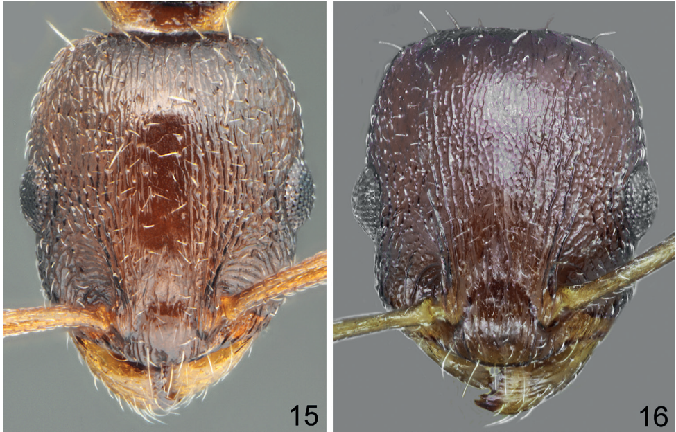
Figures 15, 16. Head sculpture of workers 15 Temnothorax parnonensis sp. nov., holotype 16 Temnothorax anodontoides Dlussky & Zabelin, 1985, paratype.

Werner (Prague), we had an opportunity to study specimens collected from the site mentioned by Schulz et al. (2007) and compare them with a paratype of T. anodontoides and our Greek samples of members of the anodontoides species-group. As a result, we concluded that the samples mentioned in the above-mentioned publication should be assigned to T. arkasi . There is also a record of T. anodontoides from Sheikmosa in Iran (AntWeb.org, CFH000026). The photographs of this specimen certainly show a species belonging to the anodontoides species-group. However, its body coloration and presence of very small but distinct propodeal spines could indicate that it represents yet another undescribed species. In conclusion, the distribution of verified T. anodontoides is most likely restricted to Kopet Dag mountains in Turkmenistan.