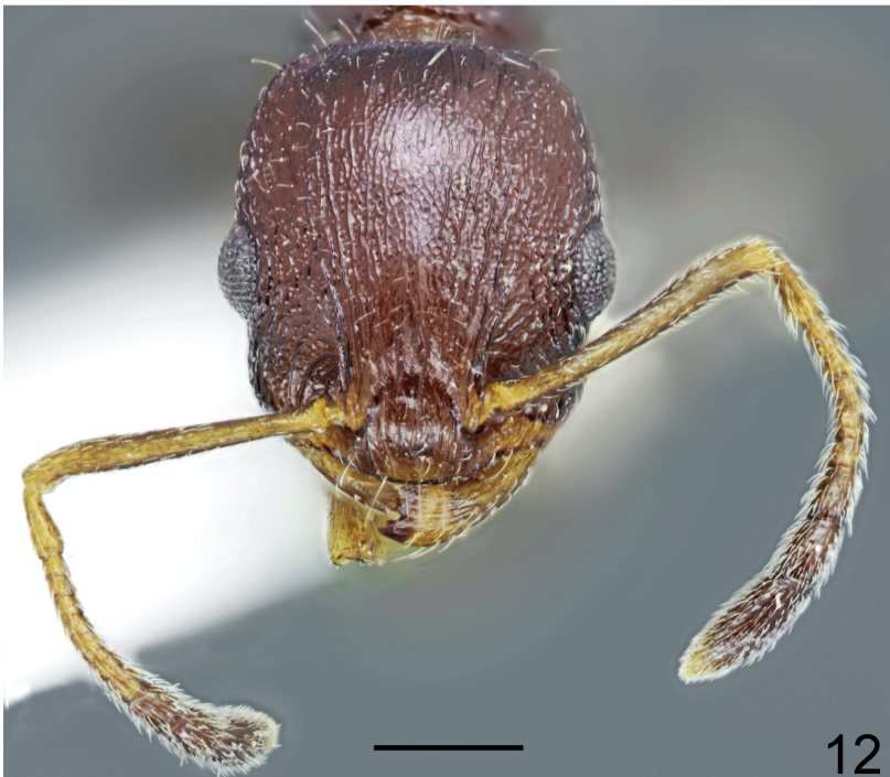
Figures 11, 12. Head and antennae of workers 11 Temnothorax parnonensis sp. nov., holotype 12 Temnothorax anodontoides Dlussky & Zabelin, 1985, paratype. Scale bars: 0.25 mm.