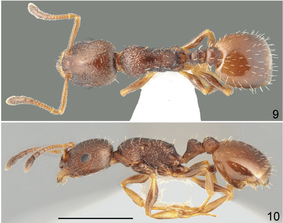
Figures 9, 10. Holotype worker of Temnothorax parnonensis sp. nov. 9 dorsal 10 lateral. Scale bar: 1 mm.

0.1 \pm 0.01 (0.08–0.12); PEL: 0.3 \pm 0.03 (0.25–0.37); PPL: 0.18 \pm 0.02 (0.15–0.2); PEH: 0.22 \pm 0.02 (0.19–0.26); PPH: 0.2 \pm 0.02 (0.17–0.24); PNW: 0.41 \pm 0.03 (0.33–0.46); PEW: 0.18 \pm 0.02 (0.13–0.24); PPW: 0.24 \pm 0.02 (0.2–0.28); CI: 1.17 \pm 0.03 (1.11–1.23); SI1: 0.74 \pm 0.03 (0.68–0.78); SI2: 0.86 \pm 0.03 (0.81–0.93); MI: 0.52 \pm 0.02 (0.5–0.56); EI1: 0.72 \pm 0.06 (0.62–0.86); EI2: 0.16 \pm 0.01 (0.14–0.18); PI: 1.37 \pm 0.05 (1.27–1.48); PPI: 0.89 \pm 0.08 (0.75–1.06); PSI: 1.19 \pm 0.14 (1.08–1.67).