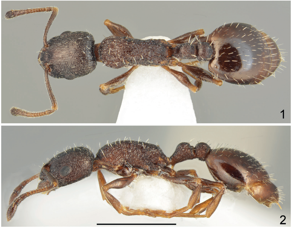
Figures 1, 2. Holotype worker of Temnothorax arkasi sp. nov. 1 dorsal 2 lateral. Scale bar: 1 mm.