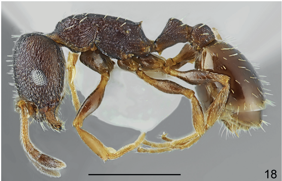
Figures 17, 18. Paratype worker of Temnothorax ikarosi Salata, Borowiec & Trichas, 2018. 17 dorsal 18 lateral. Scale bar: 1 mm.