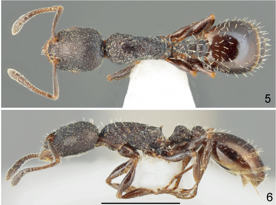
Figures 5, 6. Holotype worker of Temnothorax euboeae sp. nov. 5 dorsal 6 lateral. Scale bar: 1 mm.