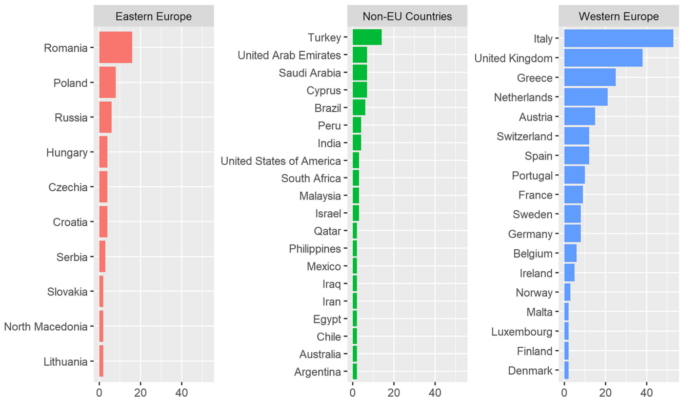
Fig. 1 Geographic origin of participants to the survey, grouped by three different areas. Countries with less than two respondents were not plotted

Attitude towards BAC reporting was not significantly influ-enced by gender, age, geographic origin, job position, years