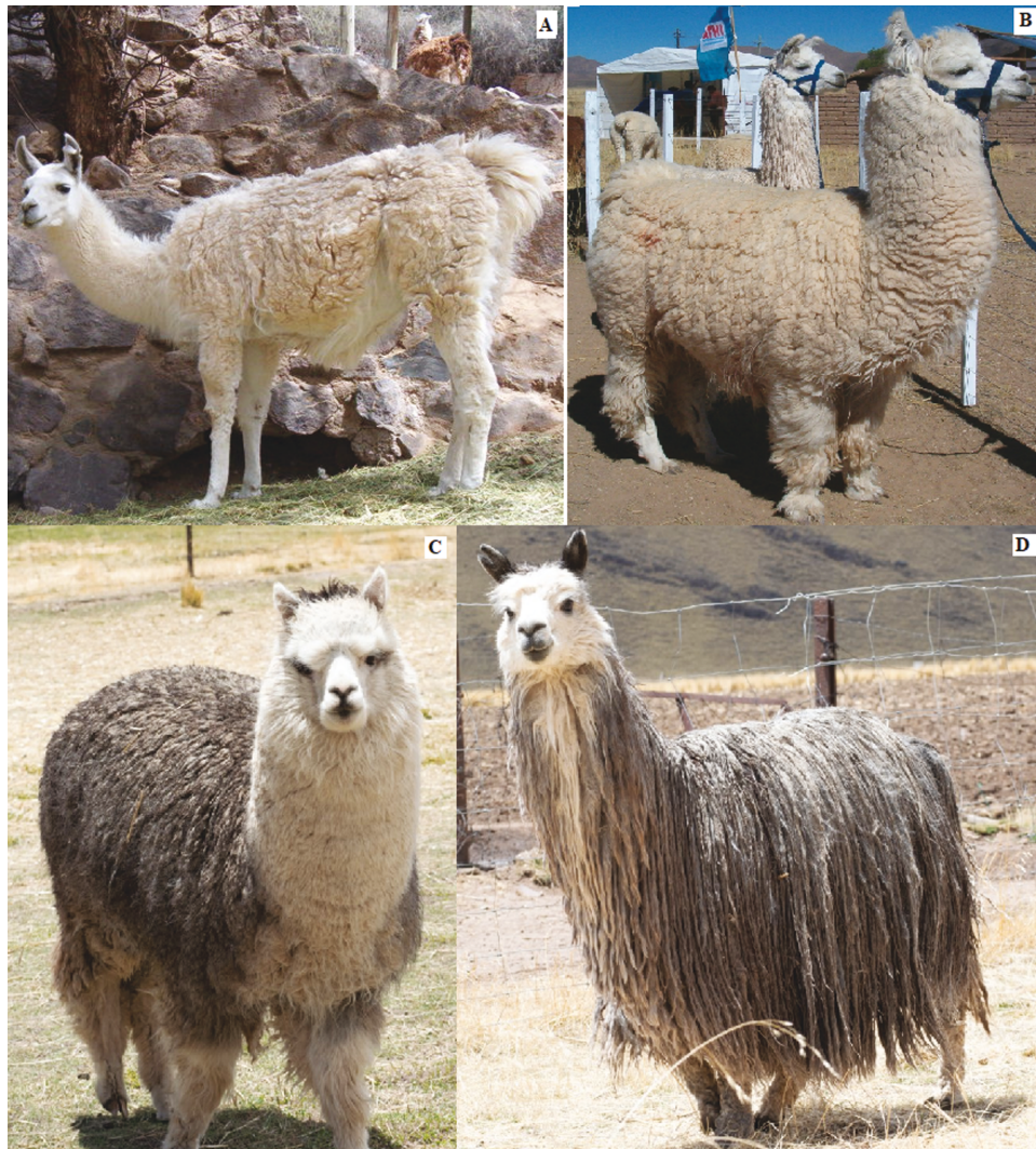
Figure 4. Morphotypes of llamas and alpacas: A) llama K'ara B) llama T'hampulli C) alpaca Huacaya D) alpaca Suri (photo courtesy of Alan Cruz Camacho).