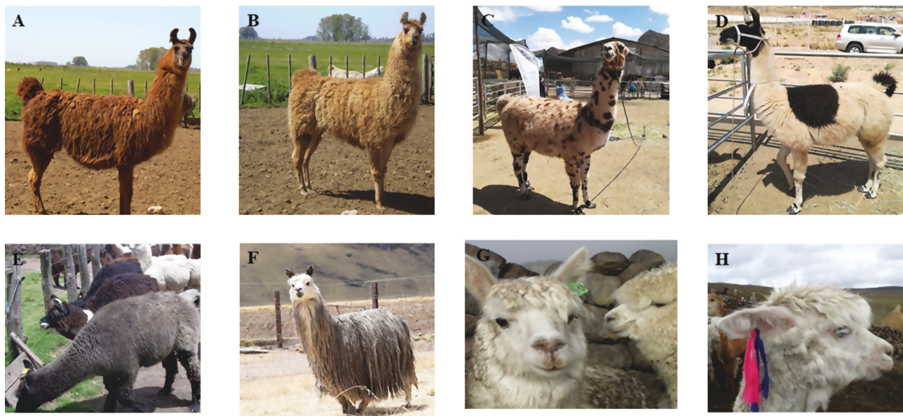
Figure 2. Photographs of llamas and alpacas illustrating color phenotypes. A. reddish-brown (nondiluted) llama. B. fawn (diluted) llama C. appaloosa or tajlio spotted llama. D. spotted llama. E. gray llama. F. gray alpaca. G. white alpaca. H. BEW alpaca.

On another note, congenital deafness is a common defect in domestic South American camelids that present the BEW phenotype, which is white hair coat and solid blue eye color, as opposed to white animals which have pigmented eyes (Figure 2H and G). No data is available in South American populations, but Jost et al., (2020) reported that more than 50% of BEW animals are suspected to be deaf, based on breeders' observations in domestic South American camelids from European countries. This number may be higher, as suggested by a previous study carried out by Gaulty et al. (2005) who objectively assessed the auditory function of llamas and alpacas and found that near 80% of BEW animals were deaf. Two KIT -microsatellite markers, named bew1 and bew2, have been associated to the BEW phenotype. These markers are in linkage disequilibrium with the causal mutation, which could be in either the KIT gene itself or its regulatory region (Jackling et al., 2014).