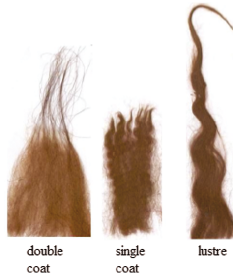
Figure 3. Type of fleece (reproduced and modified from Frank, 2001).

In mammals, the fiber is a highly organized structure, composed mainly of the cuticle, the cortex, and the medulla (Plowman et al., 2009) (Figure 5). The cortex represents 90% of the fiber and it consists of keratin intermediate filaments (KIFs) embedded in a matrix of keratin-associated proteins (KAPs) (Kuczek and Rogers, 1987). KAPs alongside KIFs provide the major structural support for the fiber and define its physical-mechanical properties, such as strength, inertia, and stiffness (Powell and Beltrame, 1994). The large number of KIFs and KAPs that conform the fiber suggests that their relative composition and interactions are key determinants of fiber characteristics (Rogers, 2006).