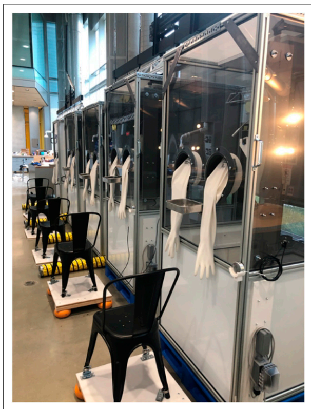
Figure 3. The positive testing booths before clinical deployment.

for healthcare providers by medical experts and can be manufactured using exclusively off-the-shelf components from vendors such as McMaster Carr, Home Depot, and 80/20. The booth design was licensed to a local Baltimore company and is now commercially available.