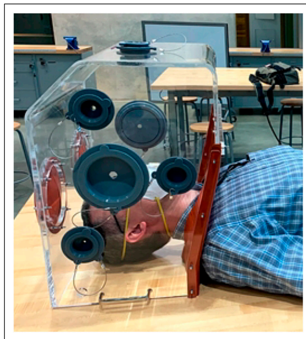
Figure 4. Picture of the Airway respiratory aerosol containment chamber prototype during testing.

Patient aerosol containment chamber. Our third example device project is also focused on reducing the infection risk of medical personnel. The Respiratory Aerosol Containment Chamber for Airway Management (Airway RACC), designed in collaboration with the University of Maryland, is a personal respiratory protective device designed to be used by healthcare providers during airway management procedures (including for endotracheal intubation and extubation) in patients suspected to be infected with COVID-19. 8 The product is intended to reduce exposure of healthcare providers to airborne respiratory aerosols and droplets that are ejected during airway management procedures. The design consists of an acrylic structure with rubber seals around the patient head and tubes (Figure 4). The in-room suction provides negative pressure to the booth, which reduces the risk of exposure to healthcare providers over more open hood designs. We received notice from the Food and Drug Administration (FDA) that the device falls under Emergency Use Authorization for Face Shields and submitted an EUA