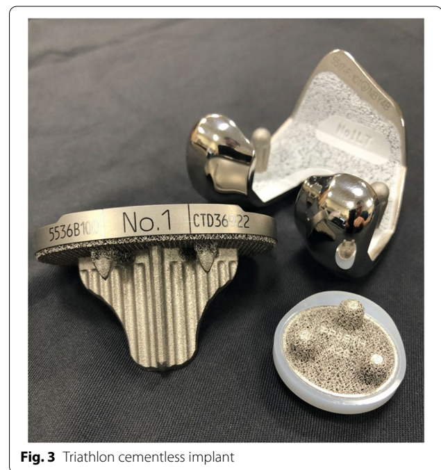
Fig. 3 Triathlon cementless implant

For decades cemented TKAs have been widely accepted as the gold standard for total knee replacements [47]. Recent advancements in additive manufacturing and designs of implants, which used to be too complicated to mass produce, have led to change in opinions on the viability of cementless TKAs. This study was conducted to investigate the clinical outcomes of one specific newer-generation cementless design, the Stryker Triathlon cementless TKA implant (Fig. 3). Mounting evidence supports the newer cementless components as a viable alternative to cemented implants and may theoretically have advantages in the long run. Bagsby et al. [11] found better PROMs and a lower revision rate when examining the morbidly obese patient undergoing TKAs with a mean follow-up time 3.6 years. Sinicrope et al. [35] found that morbidly obese patients had a higher rate of operative failure due to aseptic loosening with a cemented TKA and decreasing survivorship over time. However,