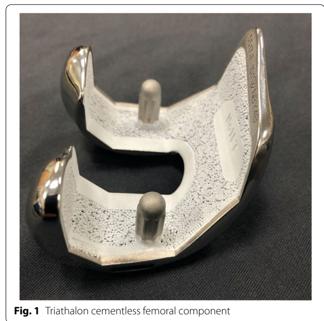
Fig. 1 Triathlon cementless femoral component

A systematic search of PubMed and MEDLINE was conducted for English language articles published from 2005 to 2021. A combination of the terms “total knee arthroplasty”, “cementless”, “uncemented”, “non-cemented”, “clinical outcomes”, “clinical scores”, and “survivorship” were used as keywords in connection with AND or OR. Level 1 to 4 studies were included in the search. The reference list of the resulting articles was reviewed for