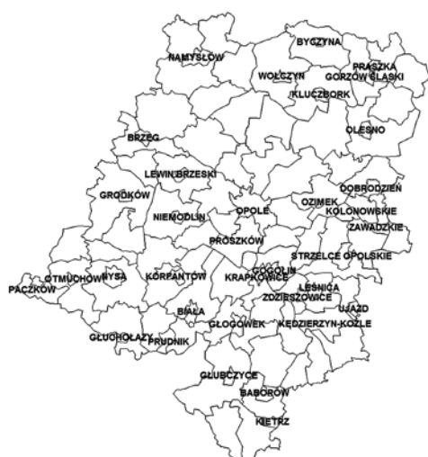
Fig. 1. Administrative map of the Province of Opole (with description of main cities)

Based on the administrative map (Fig. 1) and thematic maps (Figs. 3 and 4) it can be observed that in the most densely populated centers of the region, such as Ozimek (approx. 2840 people per sq km), Brzeg (2330), Kluczbork