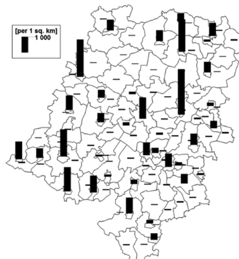
Fig. 2. Population density in the Province of Opole (2006–2010)