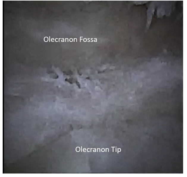
Fig 4. Arthroscopic view, right elbow, lateral decubitus position, from the transtriceps portal visualizing the posterior compartment.

diagnostic arthroscopy of all elbow compartments and describes an approach for potential therapeutic applications including loose body removal, osteo-capsular arthroplasty, lateral epicondyle debridement, and fracture fixation.