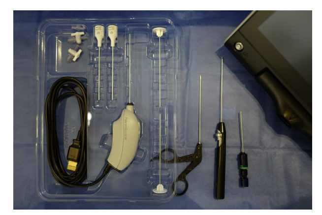
Fig 1. The needle arthroscopy set (NanoScope, Arthrex, Naples, FL) includes a zero-degree arthroscope with power cord, monitor, sharp, and blunt trochars with corresponding sheaths including inflow portals and assorted instruments.

The olecranon, medial epicondyle, lateral epicondyle, and ulnar nerve are identified and marked, as well as the following described portals (Fig 2). For access to the anterior elbow, a modified proximal anteromedial portal (mPAMP), proximal anterolateral portal (PALP), mid-anterolateral portal (MALP), and distal anterolateral portal (DALP) are used. The mPAMP is used as the primary viewing portal and is located 0.5 to 1 cm proximal to the medial epicondyle and immediately anterior to the intermuscular septum. This is a modification of the classic PAMP position, which is located 2 cm proximal to the medial epicondyle and anterior the intermuscular septum. This modification allows for a better inline view of the entire joint and is necessary due to the zero-degree viewing angle of the NA camera. Despite moving the portal slightly more distal, the decreased size of the NA camera sheath (2 mm vs 4-5 mm) makes injury to the median antebrachial cutaneous nerve unlikely. The PALP functions as the inflow portal and is located 2 cm proximal to the lateral epicondyle and 1 cm anterior to the humerus. The MALP is the primary working portal and provides direct inline access to the joint. It is located 1 cm proximal and 1 cm anterior to the lateral epicondyle. The DALP is used as an accessory working portal and is located 1 to 2 cm distal and 1 cm anterior to the lateral epicondyle, just anterior to the radial head.