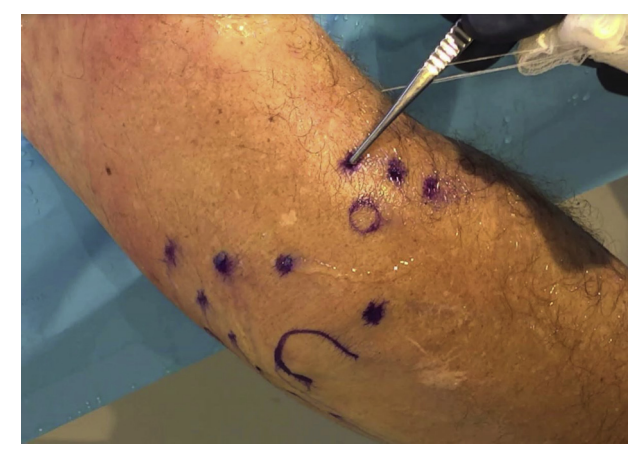
Fig 5. External view of a right elbow in the lateral decubitus position post-arthroscopy, demonstrating minimal soft-tissue disruption. Portals do not require sutures. A simple compressive soft dressing over the elbow for 48-72 hours is usually sufficient for postoperative wound care.

An important consideration in the described technique is the role of flow in establishing optimal visualization. Visualization in NA relies more upon controlling flow than upon pump pressure and fluid volume. Poiseuille's law stipulates that decreasing the radius of a tube inversely effects resistance and directly reduces flow. Therefore, the narrower cannula of the NA will necessitate adjusting the working instruments, particularly arthroscopic shavers and ablators. A standard large diameter shaver with full suction applied would rapidly remove all the fluid from the joint and create a vacuum. This should, therefore, be managed with smaller shaver diameters and judicious application of suction. The implementation of a dedicated inflow