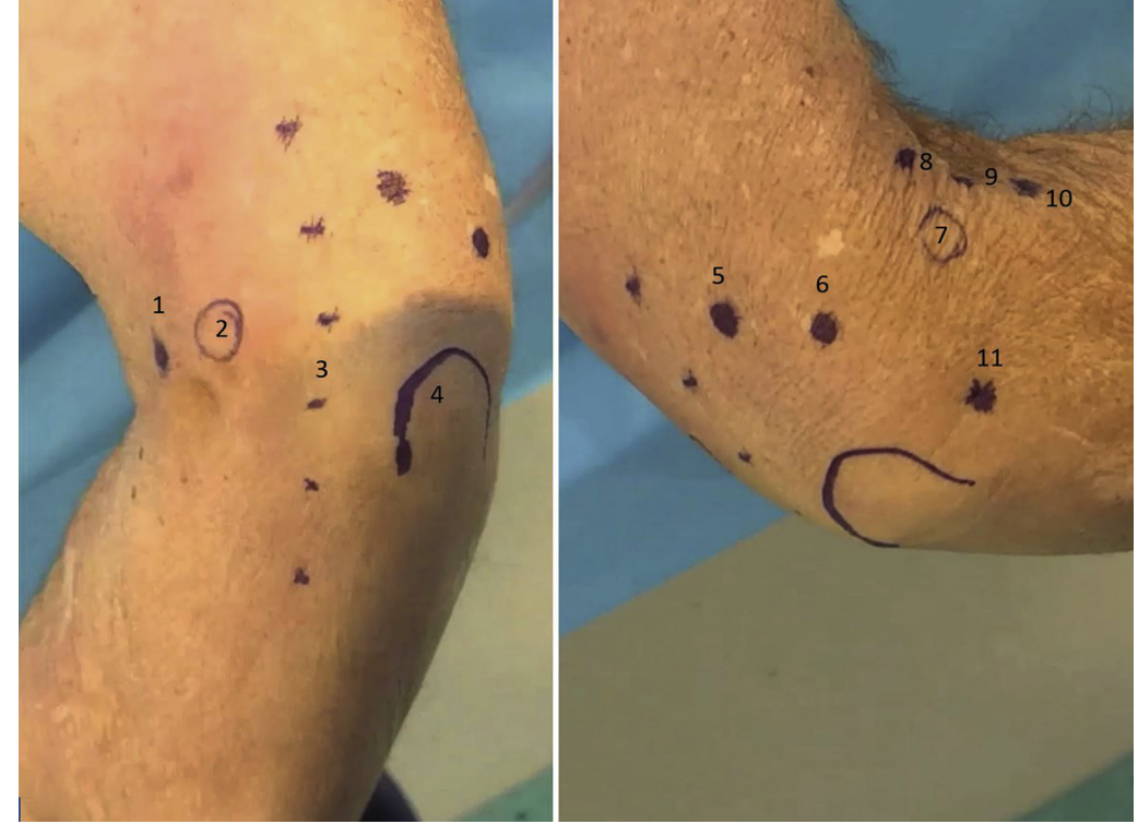
Fig 2. Left, Medial external view of a right elbow in the lateral decubitus position. 1 - modified proximal anteromedial portal, 2 - medial epicondyle, 3 – ulnar nerve, 4 – olecronon. Right, Lateral external view of a right elbow in the lateral decubitus position. 5 – transtriceps portal, 6 – posterolateral 7 portal, lateral epicondyle, 8 – proximal anterolateral portal, 9 mid-anterolateral portal, 10 - distal anterolateral portal, 11 - soft-spot portal.

Once the NA system is established, additional working portals can be made by using the NA sharp trochar (without a sheath). The diameter of the trochar allows for a wide enough percutaneous hole for dedicated NA instrumentation to pass through. The authors recommend the MALP as the primary working portal. The DALP can be created as an accessory working portal as required. Instrumentation can then be inserted, and arthroscopic treatment performed as indicated.