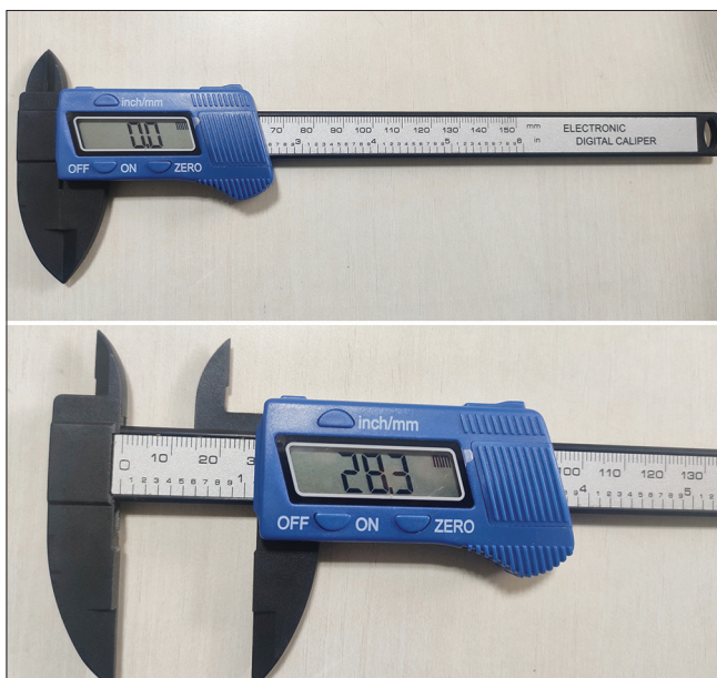
Figure 1: SAFESEED carbon fiber electronic vernier digital caliper

Amblyopia was defined as the difference of two lines or more in visual acuity between the two eyes or a visual acuity worse than or equal to 6/9 with the best optical correction or a lack of central, steady, and maintained fixation. [9] Children with amblyopia were treated with part time occlusion therapy and followed up every 2–3 months. All children were followed up every 6 months for a minimum period of 12 months (two follow-ups) and a maximum period of 18 months (three follow-ups). Those children who missed their follow-up because of coronavirus disease 19 (COVID-19) lockdown (April 2020) came during the last week of May 2020. COVID-19 protocols were followed while these children with their parents were in hospital. Children with strabismus at presentation were followed up with BCVA, stereopsis test, and all tests for ocular deviation as in the first visit to understand the status of stereopsis, strabismus, and amblyopia and hence the need for further intervention. Children without strabismus at the first visit (pseudo-strabismus) were evaluated to detect its development at each follow-up visit. Children who had or