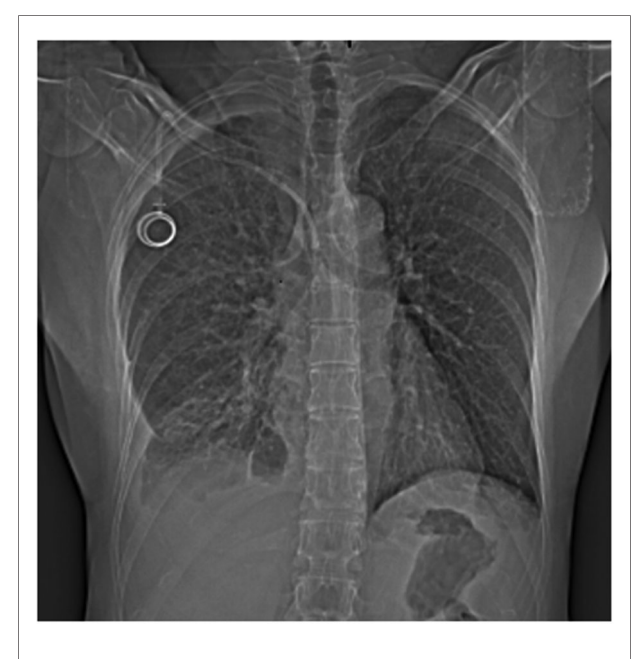
FIGURE 1 Chest x-ray showing a large right pleural effusion with abnormal position of the distal tip of the Port-a-Cath.

After the first administration of the antidote, the patient underwent surgical removal of the Port-a-Cath by triportal