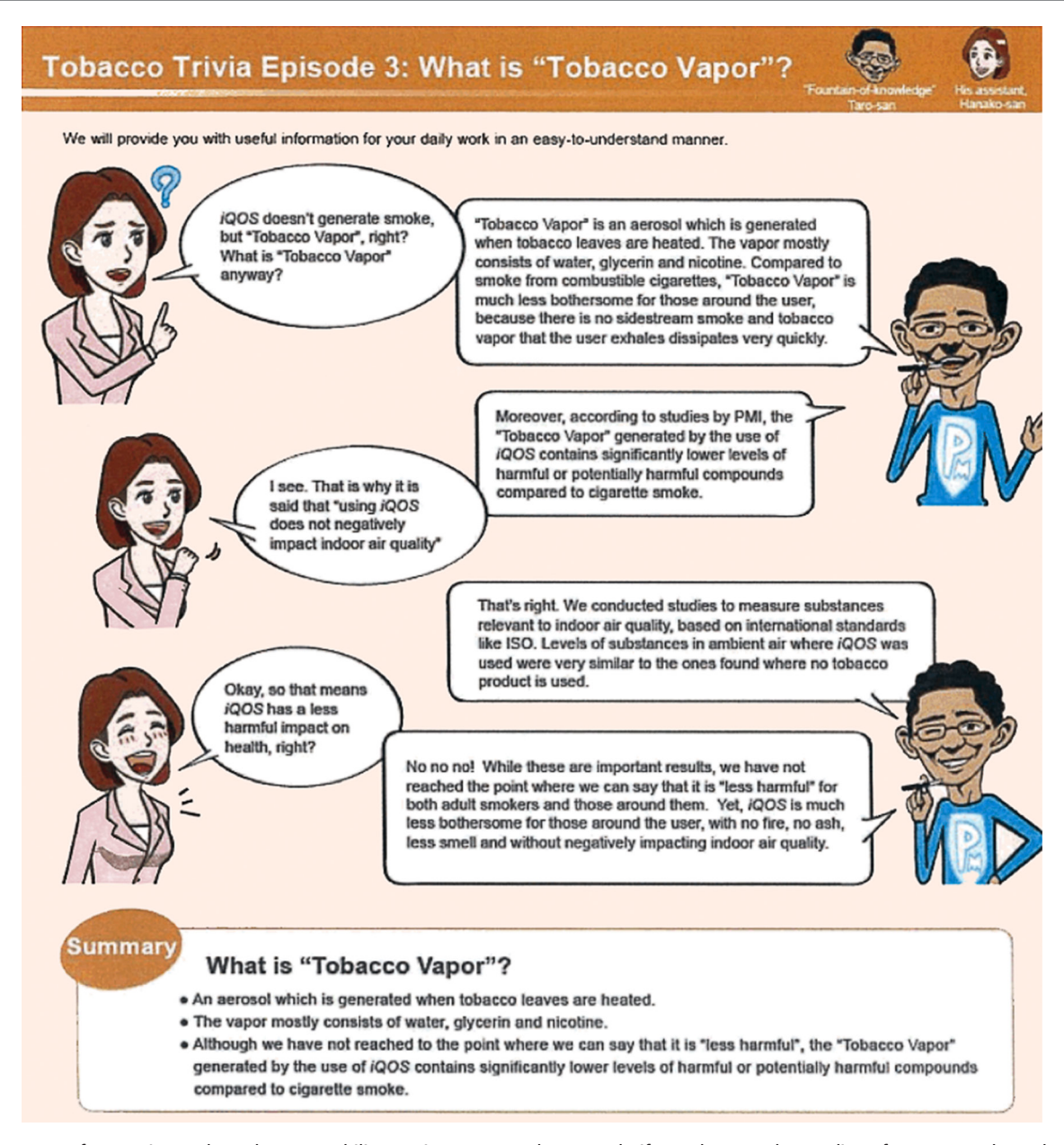
Figure 2 Excerpt from an internal October 2015 Philip Morris Japan newsletter. To clarify employee understanding of IQOS, a mock employee asks: '... iQOS has a less harmful impact on health, right?' The company expert replies, 'No no no! While these [ambient air reductions] are important results, we have not reached the point where we can say that it is "less harmful" for both adult smokers and those around them.'<sup>74</sup>