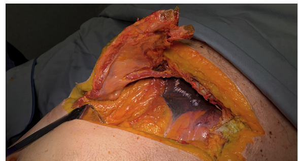
Figure 2. Suction techniques. Ex vivo cadaveric liver.