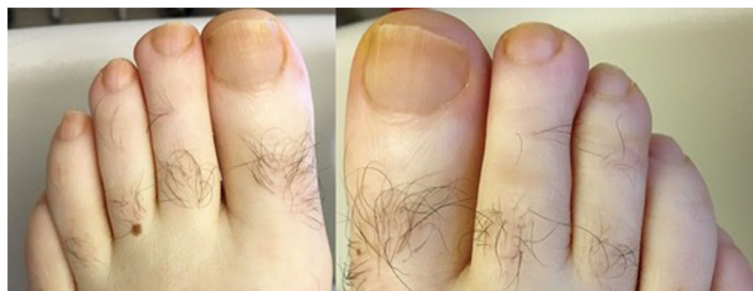
Fig. 2 On post-operative day 28 after coronary artery bypass grafting, the patient noted yellow toenail discoloration not present prior to admission

Since the first report in 1964 [4], fewer than 400 cases of YNS have been described in the literature. The etiology remains unknown, with prior associations including malignancies (especially lymphoma), immunodeficiency disorders, tuberculosis, diabetes mellitus, thyroid dysfunction, Guillan-Barré syndrome, and others. This is the second report of YNS associated