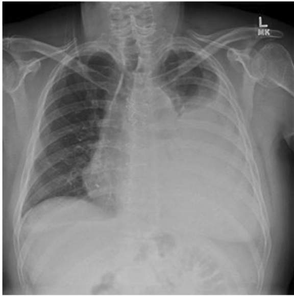
Fig. 1 Chest radiograph detected a large pleural effusion over the left lung field on post-operative day 13 after coronary artery bypass grafting

lung field. Chest radiograph confirmed a large left pleural effusion (Fig. 1). A left pigtail catheter drained 2.3 l of milky fluid with a triglyceride level of 1604 mg/dL, diagnosing chylothorax.