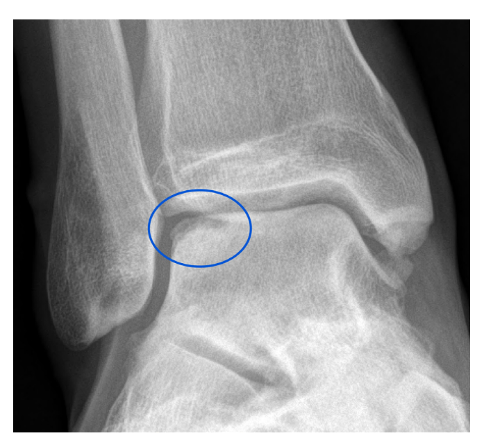
Figure 1 Pre-treatment X-ray showing evidence of an osteochondral lesion (blue circle).

The current level of evidence of MSC therapy was thoroughly discussed with the patient and he received formal written information regarding the use of and relative risks that may be associated with MSC therapy. Alternatives including excision and curettage in isolation, additional bone marrow stimulation methods and graft techniques including OATS and ACI were discussed. Prior to commencement of treatment, the patient completed formal written consent.