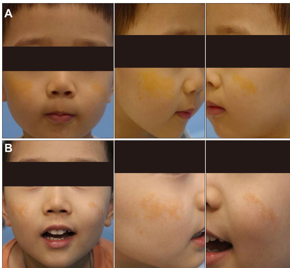
Fig. 1. We received the patient's consent form for publishing all photographic materials. (A) Initial photography of the bilateral symmetric yellowish plaques distributed on both cheeks. (B) Six-month follow-up photography after a single session of fractional ablative CO 2 laser, showing reduced sizes of the lesions.

high density lipoprotein-, and low density lipoprotein-cholesterol were within normal limits. A skin biopsy was performed, and the histologic findings showed numerous foam cells with several Touton giant cells consisting of a lipid cytoplasm with a ring of nuclei, and occasional foreign body giant cells, throughout the upper dermis (Fig. 2A, B). The immunohistochemical staining result was positive for CD68 and negative for S-100 (Fig. 2C, D). Based on the clinicopathologic features, the patient was diagnosed as a SGFP-JXG. As the lesion did not show any signs of spontaneous regression, we performed a single session of fractional ablative CO 2 laser, and a significant reduction of the size was observed throughout the next 6 months of follow-up period without signs of recurrence (Fig. 1B).