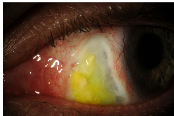
Figure 2 Photograph of nasal scleral thinning and overlying calcific plaques of the left eye.

Three weeks prior to presentation at our institution, the patient was treated with topical moxifloxacin for an episode of conjunctivitis within the left eye. During a follow-up visit, the patient developed anterior uveitis for which topical steroids were prescribed; despite this treatment, the inflammation did not resolve. At this point, the patient was then referred to our quaternary care facilities for further evaluation. On initial presentation, the patient did not have any associated pain or other ocular symptoms, and demonstrated uncorrected visual acuity of 20/30 in the right eye and 20/70 in the left eye; tonometric evaluation was not performed. Slit-lamp examination revealed bilateral nasal scleral thinning and corresponding regional scleral avascularity, which was more prominent in the left eye. Associated overlying calcific plaque formation and prominent accompanying epithelial irregularities visualized with fluorescein staining were also present (Figures 1 and 2).