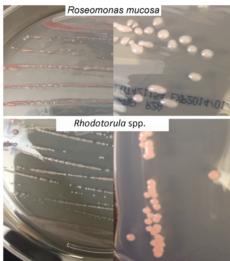
Fig. 2 Colony morphology for Roseomonas mucosa and Rhodotorula spp. Colony morphology for two different strains of Roseomonas mucosa (top) and Rhodotorula spp. (bottom; R. mucilaginosa , right; R. minuta/slooffiae , left) streaked linearly (left) or with four-quadrant technique (right) on R2A agar

volunteers (Fig. 1b). The predominant Gram-negative bacterium isolated by our methods was Roseomonas mucosa , a member of the alphaproteobacteria class. For two volunteers (2 and 3), no growth was seen from R2A broth, but indicated species were isolated from the HBSS tube. Other species isolated included the gamma-proteobacteria Pseudomonas aeruginosa , Pseudomonas luteola , Pseudomonas oryzihabitans , Acinetobacter radioresistens , Pantoea septica , and Moraxella osloensis . Swabs from one individual grew Methylobacterium species (alphaproteobacteria). These results are consistent with prior reports using phylogenetic and metagenomic sequence analysis [1, 2]. Two subjects grew yeast, Rhodotorula spp. ( R. mucilaginosa and R. minuta/slooffiae ), despite the presence of amphotericin B during culture, including one healthy subject from whom no Gram-negatives were cultured (identified by MALDI-TOF followed by sequencing of ITS region as described previously [8]). Colonies of Roseomonas mucosa and both Rhodotorula spp. had some initial morphological similarities that may make discernment difficult if each species is viewed in isolation (Fig. 2), but they were readily distinguished by Gram-staining.